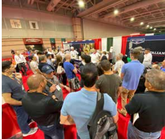
PANEL DISCUSSION ABOUT THE NEXT WAVE OF AMERICAN PIZZA