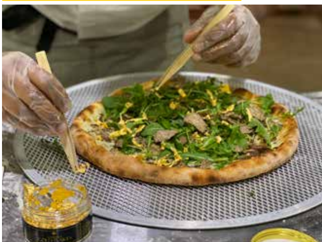
THE CAPUTO CUP